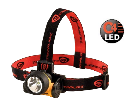
Versatile longe-range beam with a wide flood pattern

Case Material: Tough ABS thermoplastic construction with elastomer over mold; polycarbonate lens