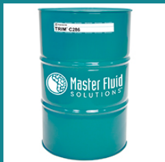
54-gallon drum SKU: C286-54G UPC-12: 641238082972