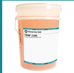
5-gallon pail SKU: C286-5G UPC-12: 641238082989