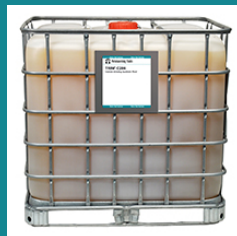
270-gallon tote SKU: C286-270G UPC-12: 641238083016