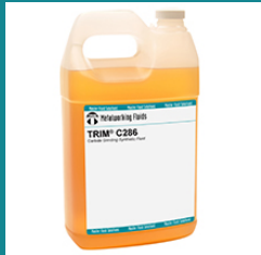
1-gallon jug SKU: C286-1G UPC-12: 641238082996