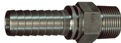
For Use With Clamps*